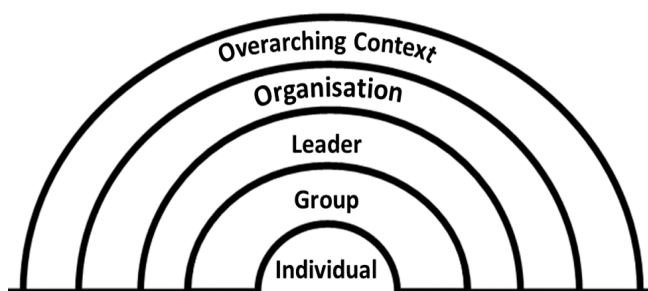
Figure 2: The IGLOO Model